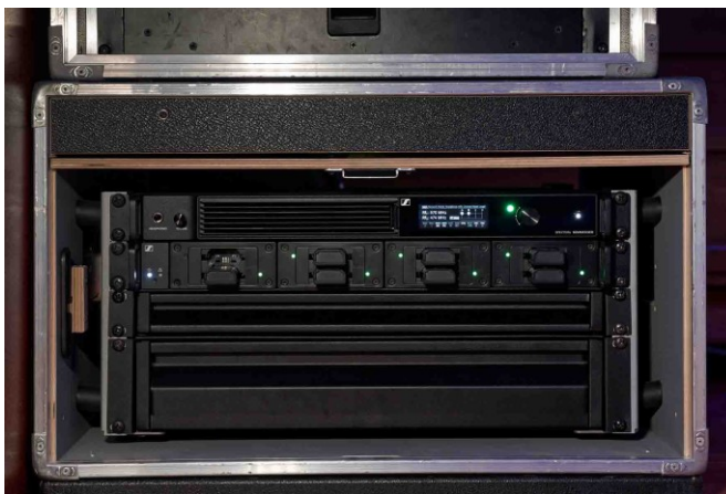
Space-saving: the Spectera Base Station with an L 6000 charging unit

Another benefit of Spectera that helps to ensure a faster set-up is its small space requirements: the Base Station takes up only one RU when it is installed in a 19" rack. Depending on the audio mode, it controls up to 64 audio links (32 inputs and 32 outputs) and uses up to two independent RF wideband channels instead of a large number of narrowband RF carriers.