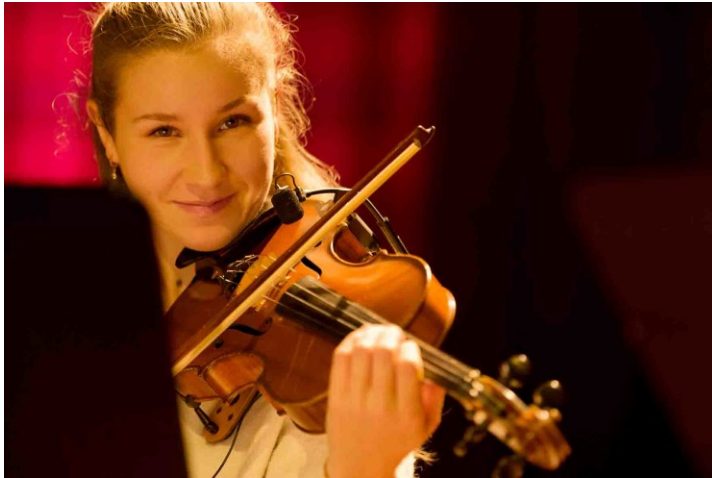
The Neumann MCM 114 Set High Strings was used for the two violins and the viola